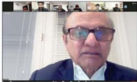
Prof. Vijay Mahajan interacting with faculty and students of IIM Jammu.

Dr. Mahajan also shared his personal life story and how his persistent support for education by his parents led to where he is